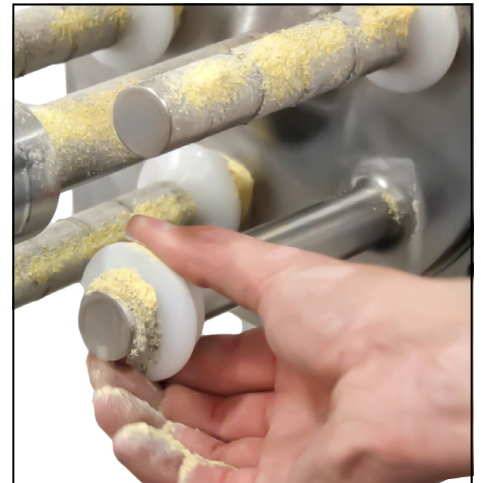
Magnets are cleaned completely outside the product zone with wiper rings.

The unit rotates powerful magnetic tubes while the product passes through. The magnetic action attracts and retains the unwanted ferrous particles, and the rotary action prevents the product from packing the process stream.